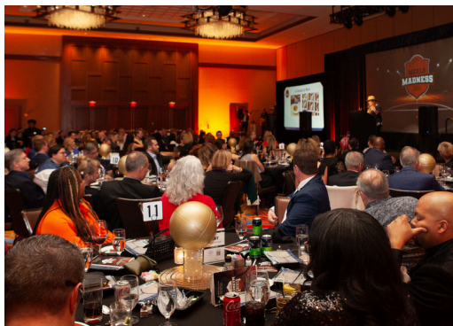
The 2024 Meals Madness Gala was held at Hard Rock Casino in Cincinnati.